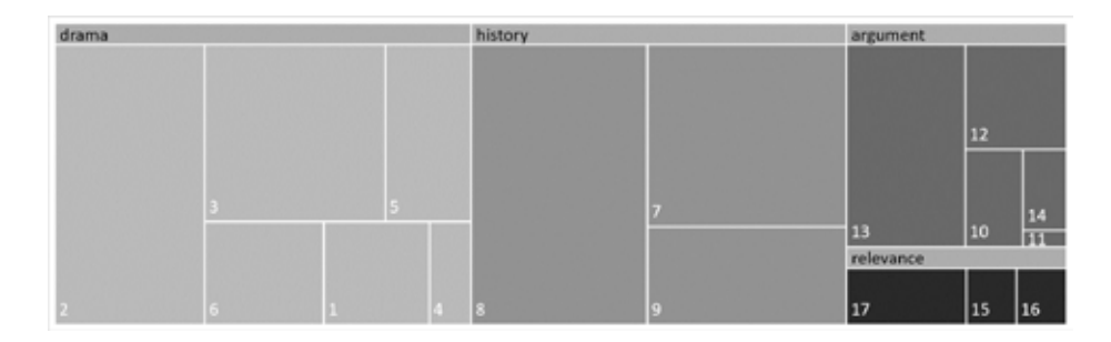
Figure 1 Use of Inherit the Wind in iWeb<sup>5</sup>

To better understand where these excerpts occur, they were sorted according to the type of website. As has been mentioned, this information was given as a variable within QDA Miner. Figure 2 shows a cross-tabulation of the codes with the type of websites where ITW was found. While it may not be surprising that "REVIEW" websites fail to notice the differences between historically accurate and fictionalized retellings, it is disturbing that "EDUCATION" and "SCIENCE" websites do not provide their readers with a more critical analysis.